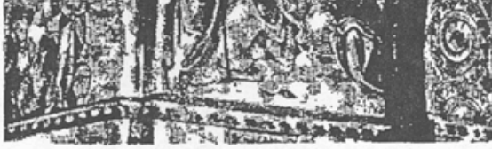
FIGURE 1. One of the four spandrels of St Mark's; seated evangelist above, personification of river below.

ornamental effect. In King's College Chapel in Cambridge, for example, the spaces contain bosses alternately embellished with the Tudor rose and portcullis. In a sense, this design represents an "adaptation," but the architectural constraint is clearly primary.